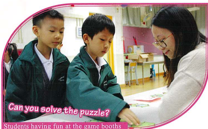
Can you solve the puzzle?