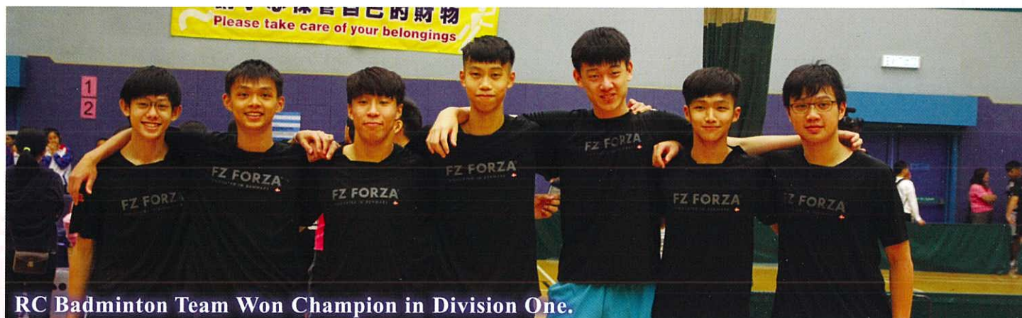
RC Badminton Team Won Champion in Division One.