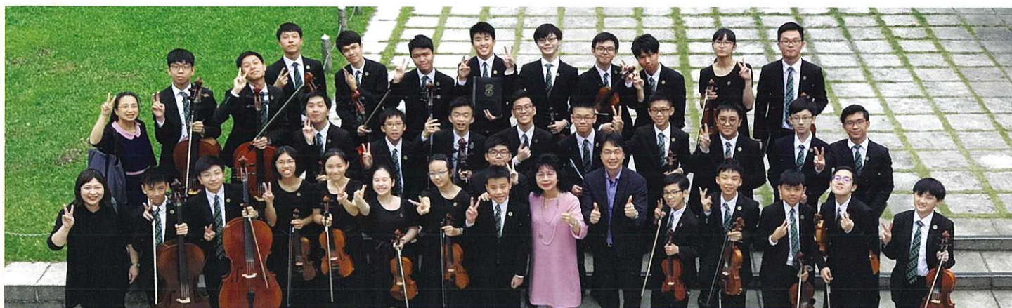
School Orchestra achieved the Gold Award in the 2018 Hong Kong Youth Music Interflows - String Orchestra Contest (Secondary School Class A); and also Silver Award in the 10 th Winter Band Festival - Senior Division.