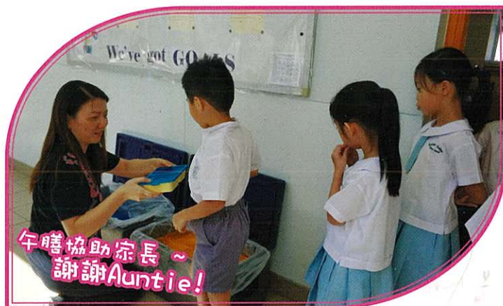
午膳協助家長 ~ 謝謝Auntie!

此外，學校亦舉辦了義工家長分享會暨茶聚，除了讓義工家長分享心得與經驗外，家長亦跟學校建立了一個溝通平台。期望在未來的日子繼續透過家校合作，攜手為學生建立一個健康、愉快的校園生活。