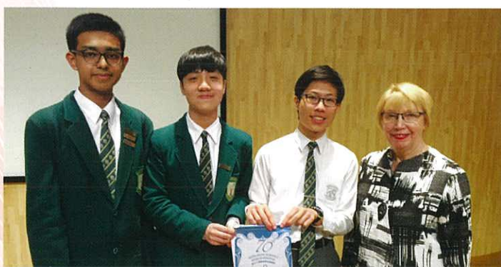
Our senior members of English Public Speaking Team won in all the competitions joined in the 70 th Hong Kong Schools Speech Festival. Our junior members got the second place.