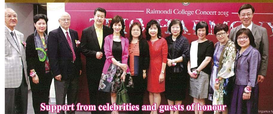
Support from celebrities and guests of honour